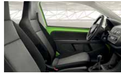
AMBITION BLACK INTERIOR Black dashboard (no cost option)