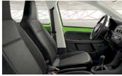
ACTIVE BLACK INTERIOR Black dashboard