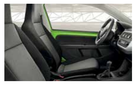
AMBITION BLACK INTERIOR Silver-Black dashboard