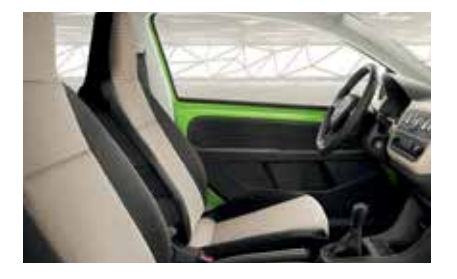
AMBITION IVORY INTERIOR Ivory-Black dashboard (no cost option)

Move & Fun (Mobile Phone mount) 6 speakers, 40w. Height adjustable driver seat Split folding rear seats Easy Entry (for 3-door version) Enhanced instrument panel Electrically adjustable and heated door mirrors Umbrella under front passenger seat