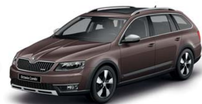
Topaz Brown metallic