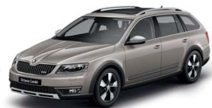
Cappuccino Beige metallic