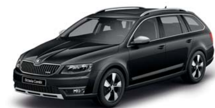
Black Magic pearl effect