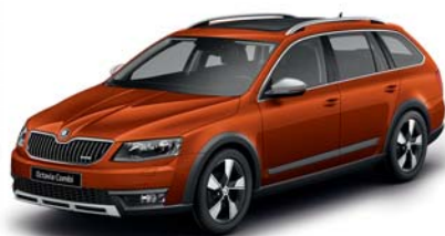
Rio Red metallic