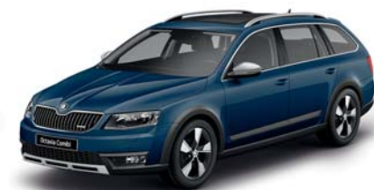
Pacific Blue uni