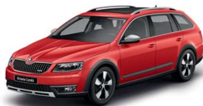
Corrida Red uni