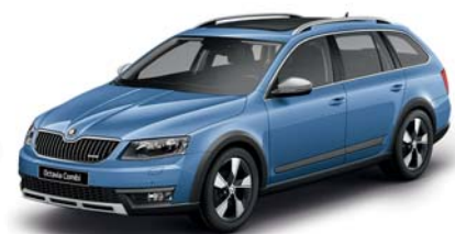
Denim Blue metallic