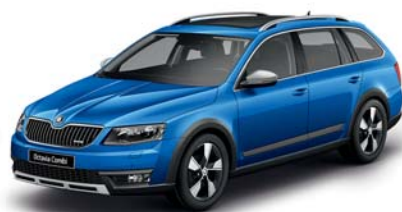
Race Blue metallic