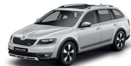
Brilliant Silver metallic