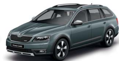
Metal Grey metallic