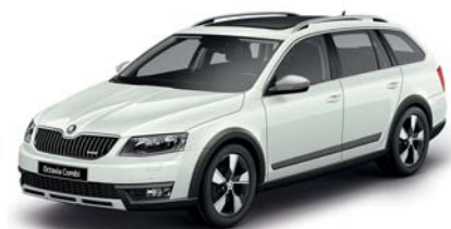
Laser White uni